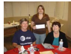
AT&T presented a donation check