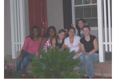
Sitting on the porch of the new Inspire house.

We could not have asked for a more special home or a more perfect location! The new Inspire home is within walking distance to Riverside Community College and many job locations. The home has undergone