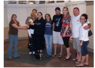
Top Team: Emergency Ambulance Service