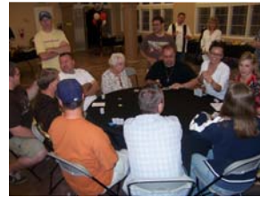
The Final Table